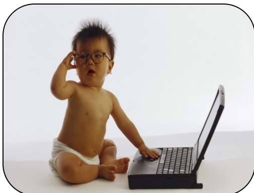
Featured Healthy Start baby entering screens!

Prenatal and Infant Screening Rates are crucial to the success of the Healthy Start Program. Each obstetrical provider serving Martin County residents is tracked on the number of clients who accept Healthy Start services and consent to the Healthy Start screen. Each practice has developed its own way to promote the crucial Healthy Start Program. The following screening rates are for this fiscal year, from July, 2009 through November, 2009.