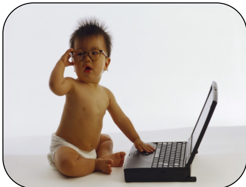
Featured Healthy Start baby entering screens!

Prenatal and Infant Screening Rates are crucial to the success of the Healthy Start Program. Each obstetrical provider serving Martin County residents is tracked on the number of clients who accept Healthy Start services and consent to the Healthy Start screen. Each practice has developed its own way to promote the crucial Healthy Start Program. The following screening rates are for this fiscal year, from July 1, 2010—September 30, 2010.