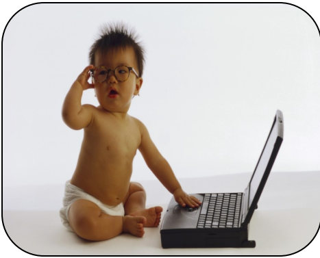
Featured Healthy Start baby entering screens!

Prenatal and Infant Screening Rates are crucial to the success of the Healthy Start Program. Each obstetrical provider serving Martin County residents is tracked on the number of clients who accept Healthy Start services and consent to the Healthy Start screen. Each practice has developed its own way to promote the crucial Healthy Start Program. The following screening rates are for this fiscal year, from July 2008 through April 2009.