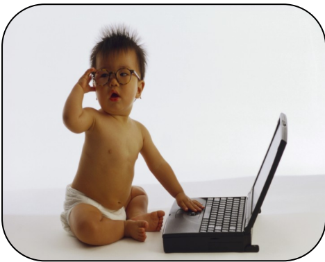
Featured Healthy Start baby entering screens!

Prenatal and Infant Screening Rates are crucial to the success of the Healthy Start Program. Each obstetrical provider serving Martin County residents is tracked on the number of clients who accept Healthy Start services and consent to the Healthy Start screen. Each practice has developed its own way to promote the crucial Healthy Start Program. The following screening rates are for this fiscal year, from July 2008 through January 2009.